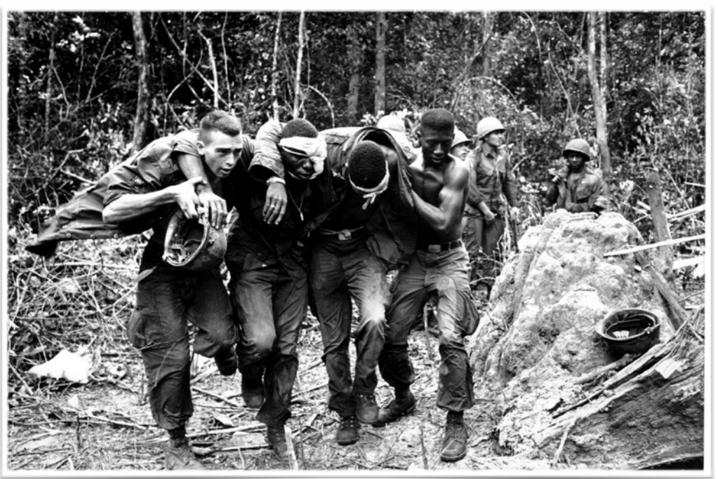
Left - Troops from the 173rd Airborne help wounded to safety. After initial contact, it took over 40 hours for the first medivac's to land. Terrain required LZ's to be cut, but were prevented by being attacked on all sides.

That was confirmed by the 1st Brigade's Presidential Unit Citation for defeating a "numerically superior enemy during 33 days of violent, sustained combat."